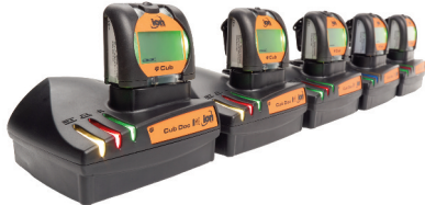
Cub's linked together within their docking stations.

When worker exposure exceeds pre-set limits the instrument's audible, vibrating and flashing LED alarms alert you to the gases present. Readings are displayed in ppb and ppm on its bright, back-lit LCD display with selectable data logging time.