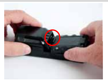
Step 1. Place the battery pack onto the charging surface at the angle shown (approximately 30 degrees).

Wedge the contactless edge of the battery pack into the adaptor's battery holder.