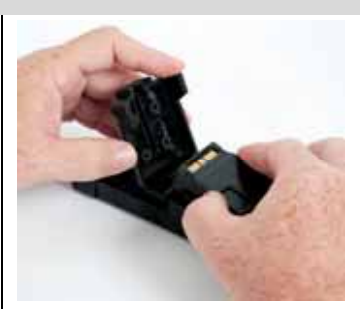
Step 2 (ER). Place the battery into the charging cradle , circuitry side facing down.

Close the cradle lid and latch it shut; a click will sound.