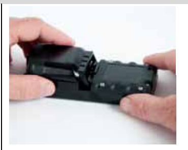
Step 2. Press down on the battery pack to secure the battery to the charging surface; a click will sound.

Align the charging contacts on the battery pack with those on the adaptor.